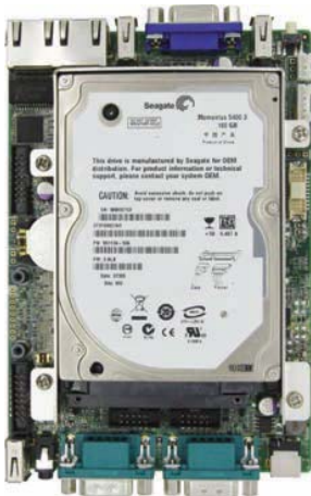
Internal Top View w/SATA

Reliability is another key advantage of CES-1525. Its fan-less and cable-less mechanical design provides superior durability, while soldered DDR3 memory offers exceptional shock/vibration resistance. The aluminum-extrusion heat sink is carefully designed to allow a -20°C to +71°C operating temperature range.